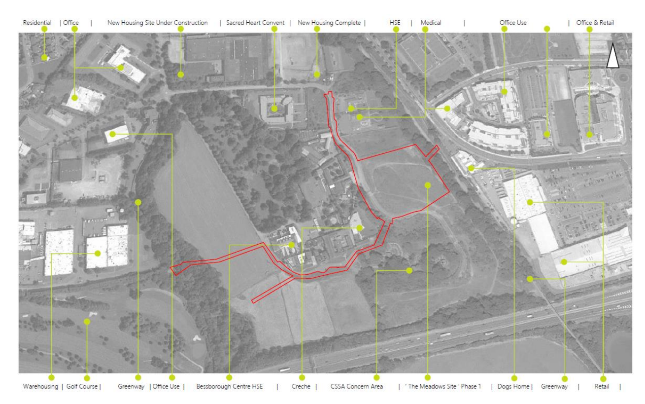
Figure 1.1 Site Context

The majority of the site is within the 'Landscape Preservation Zone' zoning use in an area that is described in the Mahon Local Area Plan as a 'key development area', with a small infrastructure element running around the south and west of the zoning. There has been significant change in this area over recent years through the development of the N40 South Ring Road, Mahon Point Shopping Centre and Retail Park, City Gate, Lough Mahon Technology Park and Mahon Industrial Estate, in addition to various residential developments particularly in nearby Jacobs Island. It is an area where further residential development is planned and anticipated in the future.